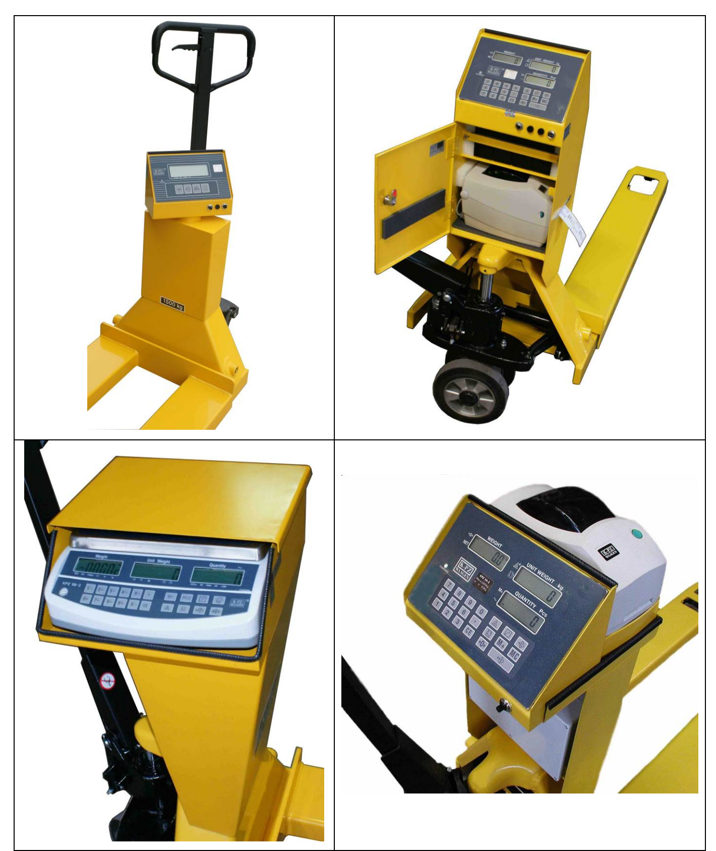
Options? Ask us, we do almost everything possible for you