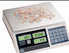
KPZ 2-04(E)-3 M High resolution counting Precision scale