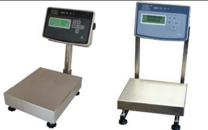
KPZ 2E06N M Bench Scale Stainless steel, DIN 1.4301 / IP67/68 and IP 69K