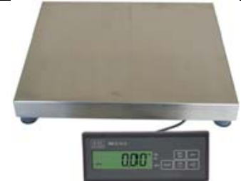
KPZ 2113 Postal Scale Capacity : up to 60 kg Inexpensive version