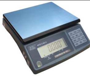
KPZ 2-02-4(E) M Universal Precision scale Inexpensive version