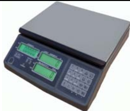
KPZ 2-04(E)-7 M High resolution and counting Precision scale Inexpensive version