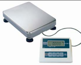
KPZ 2(E)-06A M / Bench scale Inexpensive version