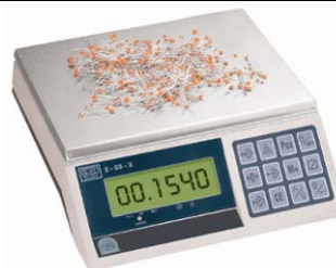
KPZ 2-03-3(E) M Universal Precision scale