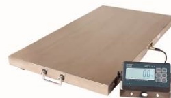
KPZ 2114 Digital VET Platform scale Capacity : up to 150/300kg