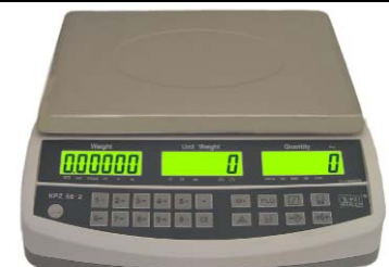
KPZ 2-04-8 Highly accurate counting scale