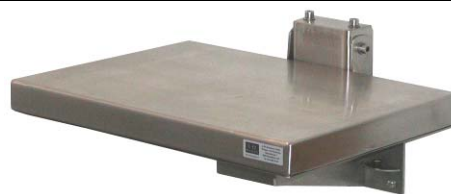
KPZ 2E-07-2N M Wall folding scale Stainless steel, DIN 1.4301 / IP67/68 and IP 69K