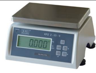
KPZ 2-03-10(E) M Digital Multi-Purpose Scale IP 65