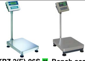
KPZ 2(E)-06S M Bench scale Capacity up to 900kg